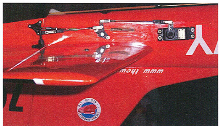
The A-6's mechanical linkage uses only one servo for the elevator halves.