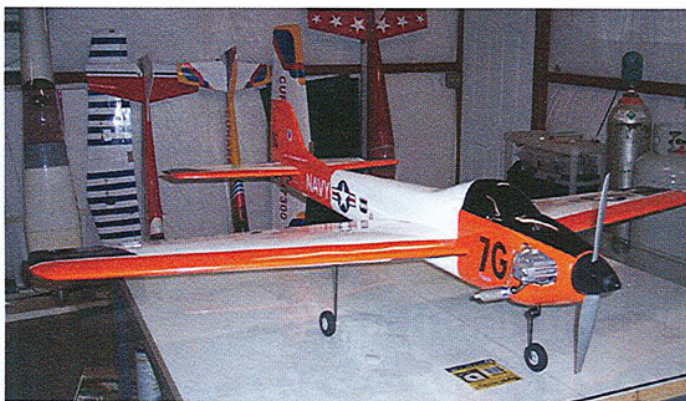
The front view of the Intruder, showing practical tricycle landing gear. It is much easier to use on grass fields.

So from another part of the precision Aerobatics world comes a different-looking but proven design for Aerobatics that is available as an ARF. It was designed to be aerobatic from inception. It has the pedigree to fly well and perform aerobatic maneuvers accurately and with grace.