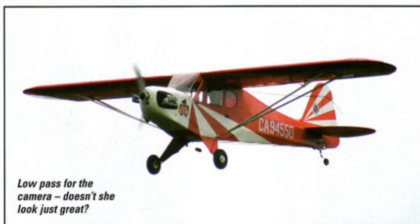
Low pass for the camera - doesn't she look just great?