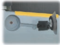
Pre-installed retractable landing gear